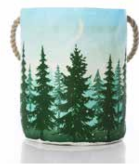
Winter Woods Bucket Bag S004566 $50