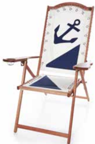
Navy Anchor Lounge Chair