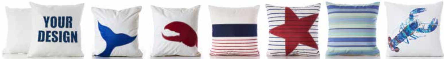
Custom Design Pillow Set of 2