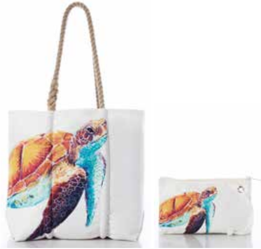
Multicolor Sea Turtle Medium Tote S004540 $160 Wristlet S004541 $30