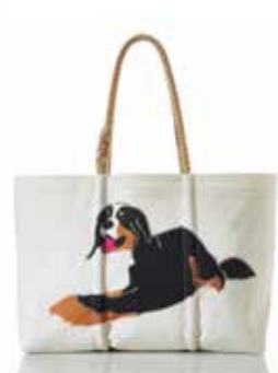
Bernese Mountain Dog Tote