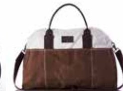
Tan Chebeague Weekender