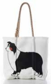
Australian Shepherd Medium Tote