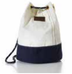
Chebeague Convertible Bucket