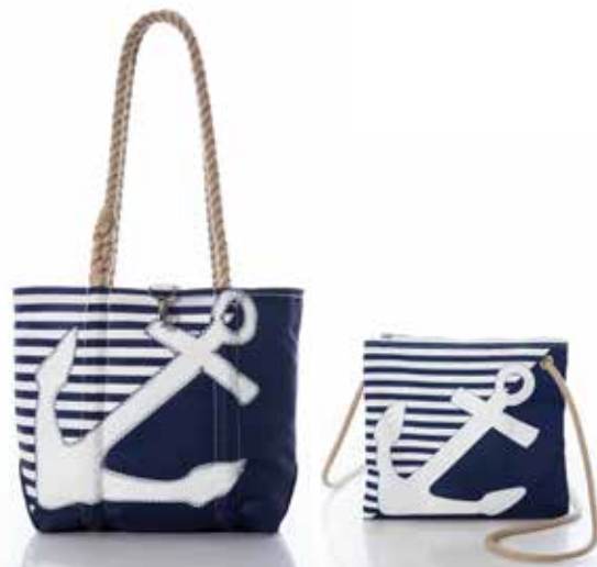
Breton Stripe White Anchor Handbag S004507 $140 Slim Crossbody S004508 $75