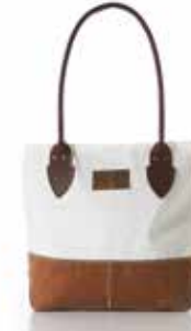
Tan Chebeague Handbag