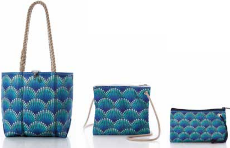
Scallop Shell Handbag S004545 $140 Slim Crossbody S004547 $75 Wristlet S004546 $30