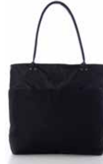
Black Chebeague Tote