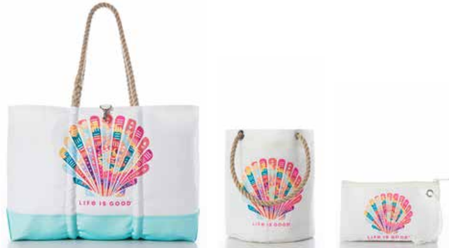
Life is Good® Multicolor Shell Ogunquit Beach Tote S004397 $250 Beachcomer Bucket S004398 $75 Wristlet S004399 $30