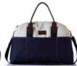
Chebeague Weekender Bag