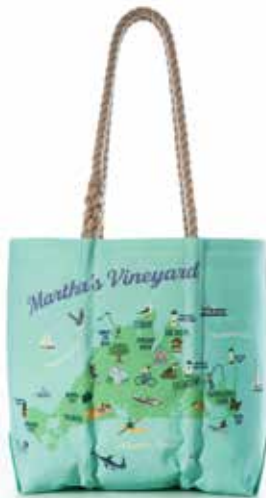
Martha's Vineyard Landmarks Tote S004501 $160