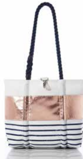
Rose Gold on Navy Mariner Stripe Handbag S004506 $140