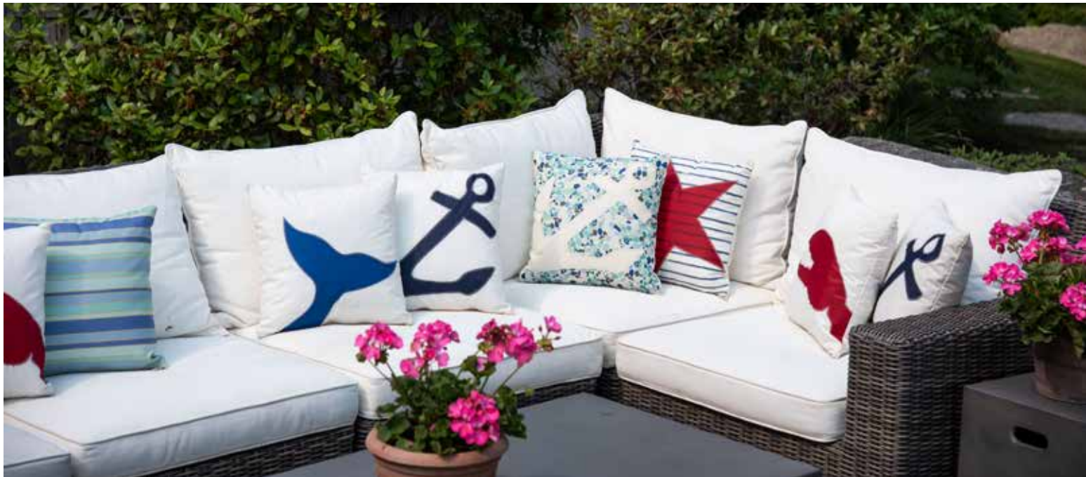
Multicolor Lobster Pillow