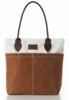
Tan Chebeague Tote