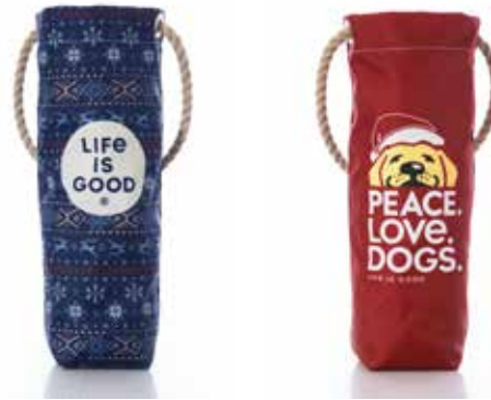
Life Is Good® Holiday Fairisle Wine Bag S004395 $40