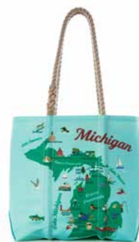
Michigan Landmarks Tote S004500 $160