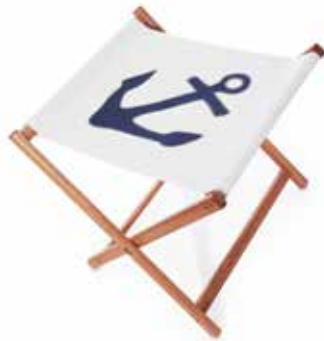
Navy Anchor Folding Stool