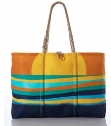
Sunrise Stripe Ogunquit Beach Tote S004539 $250