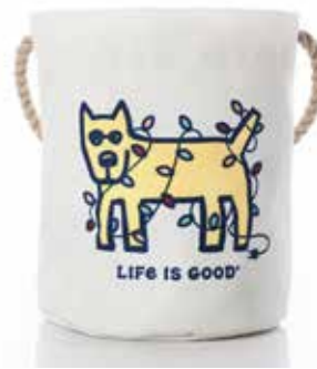
Life Is Good® Lit Rocket Bucket Bag S004393 $50