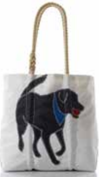
Black Lab Medium Tote