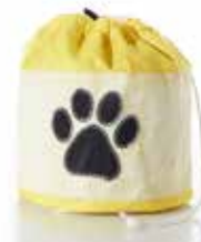
Paw Print Ditty Bag