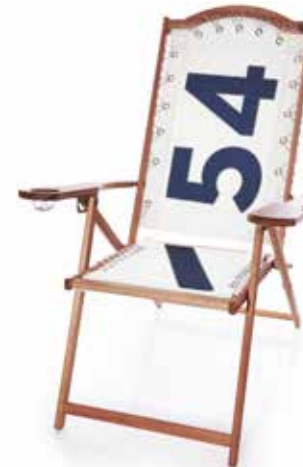
Custom Number Lounge Chair