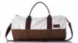
Tan Chebeague Duffel