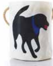
Black Lab Bucket Bag