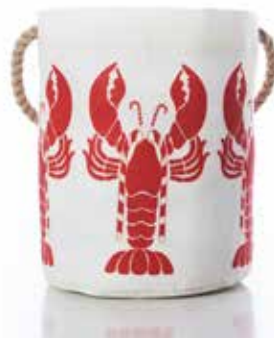
Candy Cane Lobster Bucket Bag S004568 $50