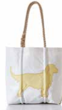
Golden Retriever Medium Tote