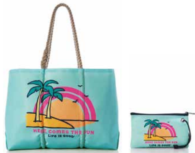
Life is Good® Sunset Palms Large Tote S004402 $180 Wristlet S004403 $30