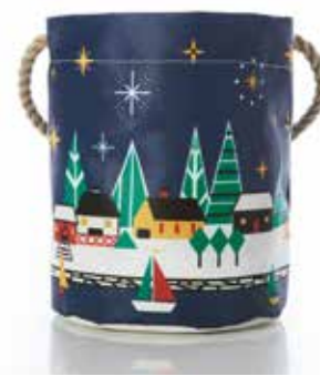
Christmas on the Coast Bucket Bag S004567 $50