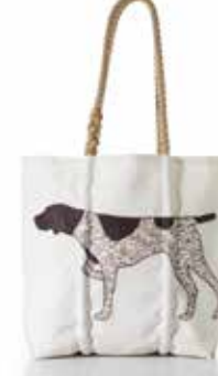
German Short Haired Pointer Tote