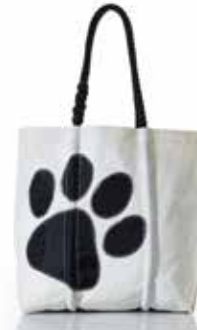
Paw Print Medium Tote