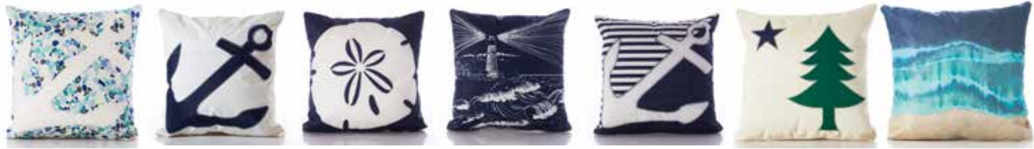
White Anchor on Sea Glass Print Pillow