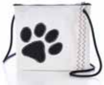
Paw Print Slim Crossbody Bag