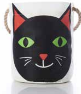
Winky the Cat Bucket Bag S004564 $50