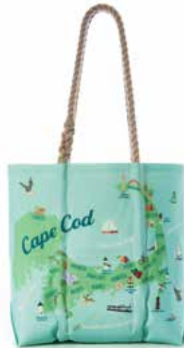
Cape Cod Landmarks Tote S004499 $160