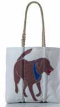
Chocolate Lab Medium Tote