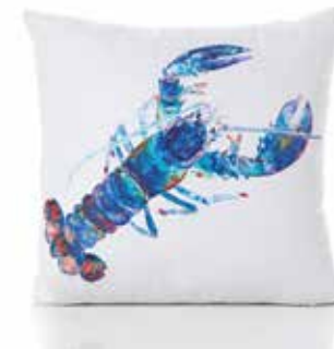
Multicolor Lobster Pillow S004505 $85