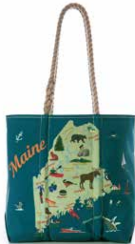
Maine Landmarks Tote S004498 $160