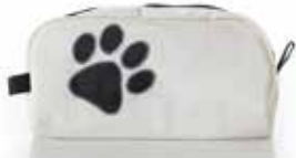
Paw Print Toiletry Bag