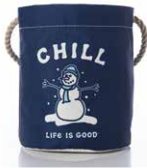
Life Is Good® Chillin Snowman Bucket Bag S004392 $50