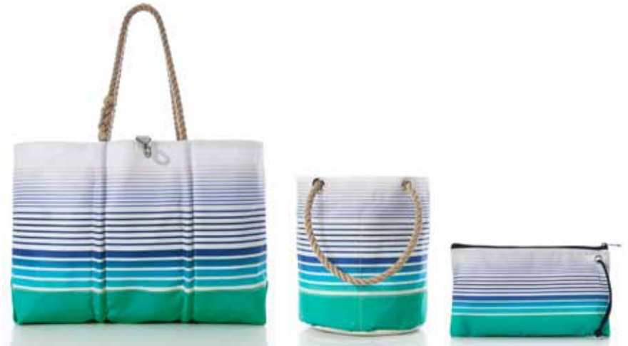
Blue Ombre Stripe Ogunquit Beach Tote S004550 $250 Beverage Bucket S004552 $75 Large Wristlet S004551 $45