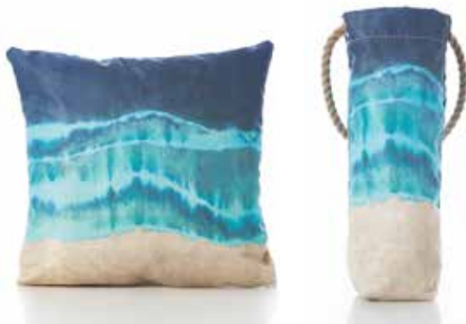
Shoreline Tie-Dye Pillow S004503 $85 Wine Bag S004504 $40