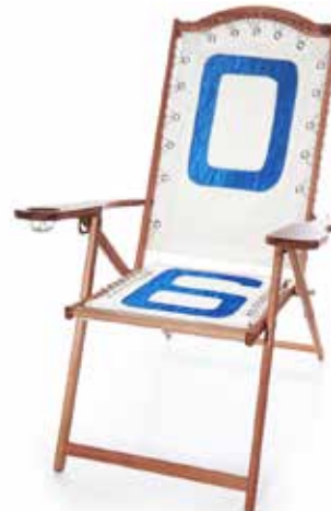
Vintage Lounge Chair Varying Designs