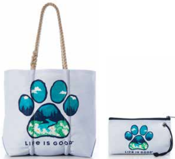
Life is Good® Landscape Paw Medium Tote S004400 $160 Wristlet P004401 $30