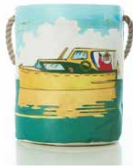
Santa's Sleigh Bucket Bag S004565 $50