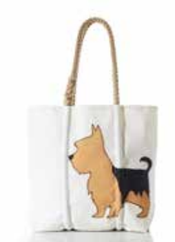
Yorkshire Terrier Tote