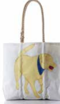
Yellow Lab Medium Tote