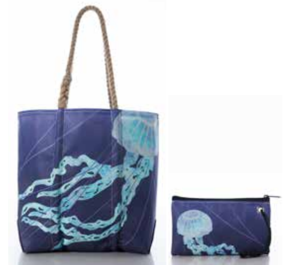
Multicolor Jellyfish Medium Tote S004548 $160 Wristlet S004549 $30