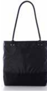
Black Chebeague Handbag