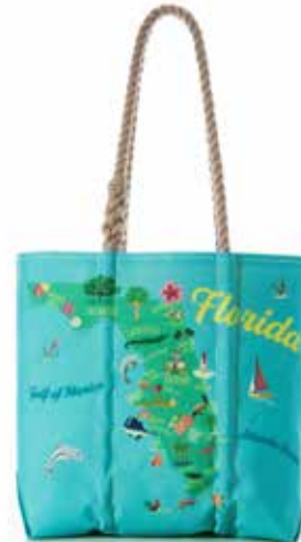
Florida Landmarks Tote S004502 $160