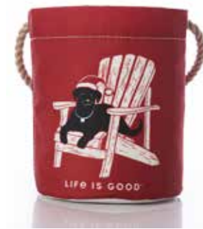
Life Is Good® Holiday Adirondack Dog Bucket Bag S004435 $50