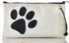
Paw Print Wristlet